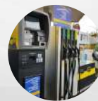
O.P.T (Outdoor payment terminal)