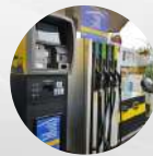
O.P.T (Outdoor payment terminal)