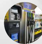
O.P.T. (Outdoor payment terminal)