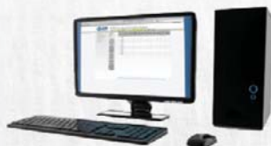
MDM 2 COMPUTER/SERVER Receives all data downloaded and generates the entire ICB suite of Prime Reports.