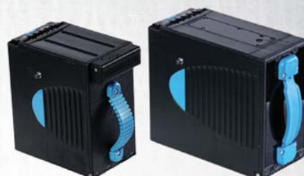
UBA® 600/1000 NOTE INTELLIGENT CASH BOX (ICB) The durable, high impact resistant cash box utilizes IR communication technology for downloading the ICB Memory Module.