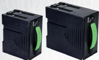
iVIZION® 600/1000 NOTE INTELLIGENT CASH BOX (ICB®) The durable, high impact resistant cash box utilizes RFID communication technology for downloading the ICB Memory Module.