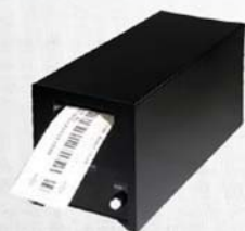
PRINTER STATION Prints critical asset and collection information gleaned from the cash box download and generates this in a bar-coded format for use in the Count Sort devices. (See below for Count Sort compatibility.)