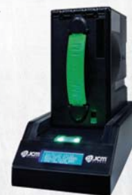
COMBO READ/WRITE TOOL Designed to download both the UBA and the iVIZION cash box data.