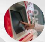
TICKET VENDING MACHINE (TVM)