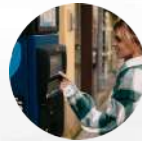
PARKING PAYMENT TERMINALS