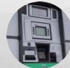
PETROL PUMP AND O.P.T