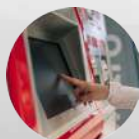
TICKET VENDING MACHINE (TVM)