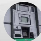
PETROL PUMP AND O.P.T