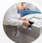
MONEY DEPOSIT MACHINES