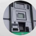
PETROL PUMP AND O.P.T