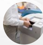
MONEY DEPOSIT MACHINES