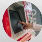
TICKET VENDING MACHINE (TVM)