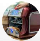
MONEY MANAGEMENT MACHINE