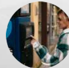
PARKING PAYMENT TERMINALS