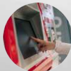
TICKET VENDING MACHINE (TVM)