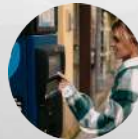
PARKING PAYMENT TERMINALS