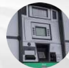
PETROL PUMP AND O.P.T