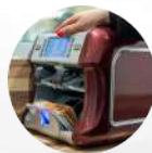
MONEY MANAGEMENT MACHINE